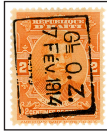
2c de gourde Type 2, reading down.