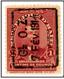
1c de gourde Type 1, reading up.