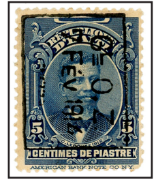
5c de piastre Type 2, reading down.

Aim: This is a comprehensive 1-frame traditional exhibit of three stamps issued in 1912 depicting Pres. Cincinnatus Leconte which had GL O.Z. overprints applied in 1914.