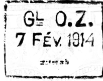
Type 1 with the point directly above the first "1" of "1914".