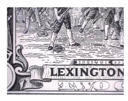
Die Essay of 2<sup>c</sup> issue Note: Lettering is incomplete, (outline only)