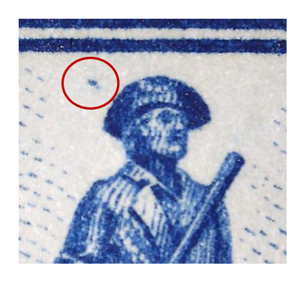
Dot Plate Flaw 5<sup>c</sup> issue

Note: This constant plate variety occurs in the lower left pane of plate 16807, stamp # 36 only.